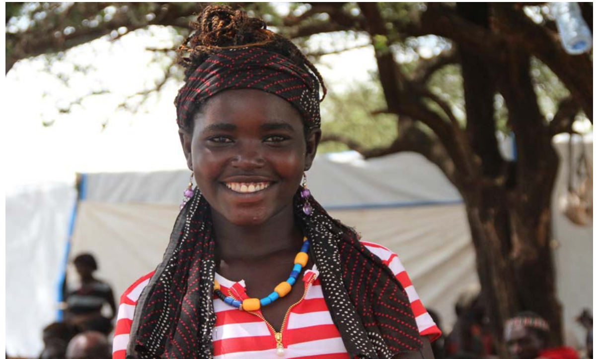
Dorze Girl, Arbaminch

In the morning transfer to domestic Airport to fly to the famous lakeside town of Arba Minch.