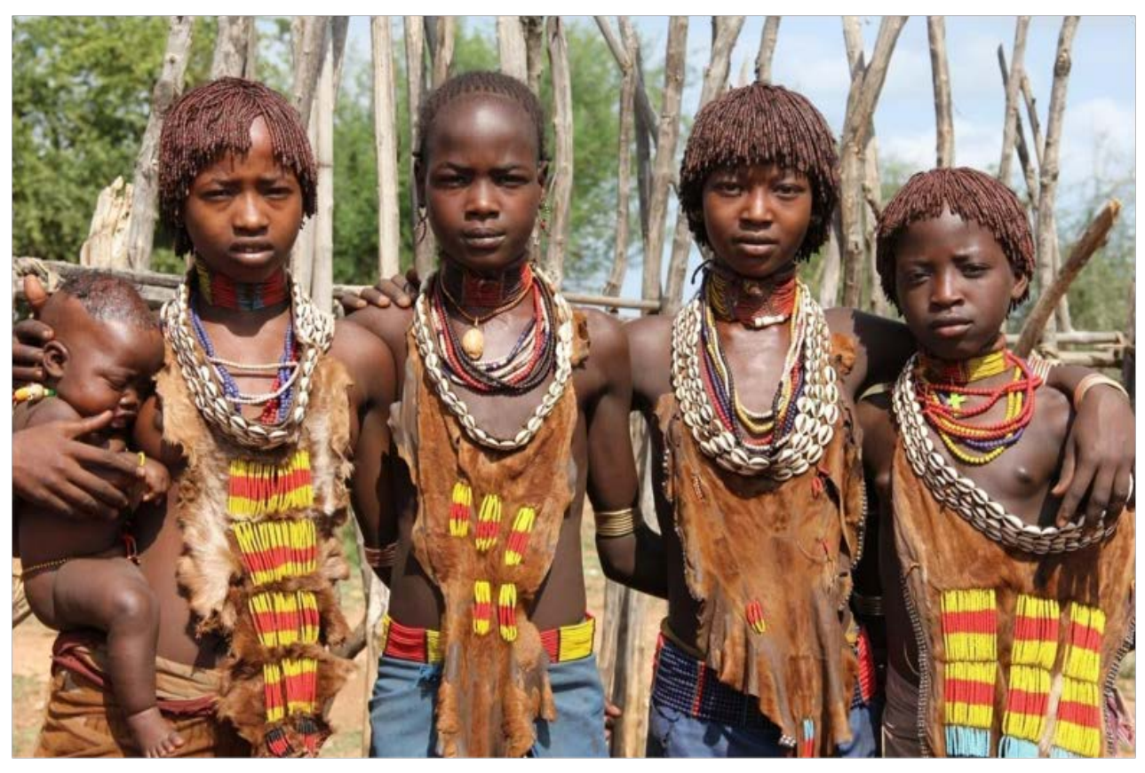
South omo Girls in Hamer

In this exotic tour you will discovering the most ethnically diverse cultures, customs and ceremonial events of some of the tribes that such as Ari, Bena, Daasanech (Geleb), Hamar, Tsemay and Mursi including the most isolated areas of the Omo Valley.