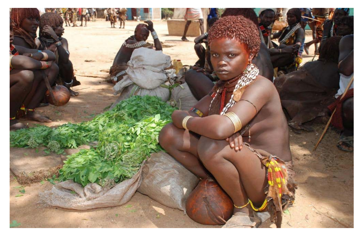
Market day in Turmi, Monday and Thursday