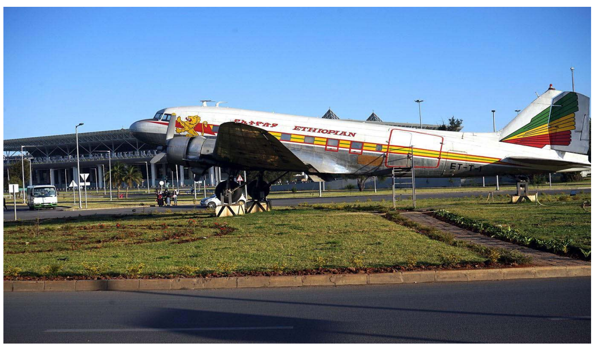
The first Aircraft of Ethiopian Airlines DC -3 at Addis Ababa Airport

After checking into the hotel and taking some time to refresh, explore the city with your private guide. The tour includes the visit of the National Museum of Ethiopia, one of the most important collections in sub-Saharan museums in Africa, where the 3.2 million years old fossil called Lucy is found and a visit to Emperor Haile Selassie's former palace – a must-see sight while you are in Ethiopia.