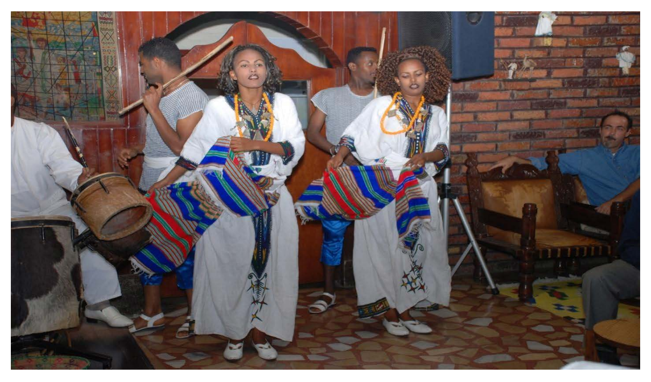
Live folklore Music & dance

Morning you will have a relaxed breakfast and leisure morning in the resort, then transfer to Arba Minch Airport to fly back to Addis Ababa. When you arrive in Addis Ababa in late afternoon you will meet your driver and you might be interested in the last minute souvenir shopping at the markets.