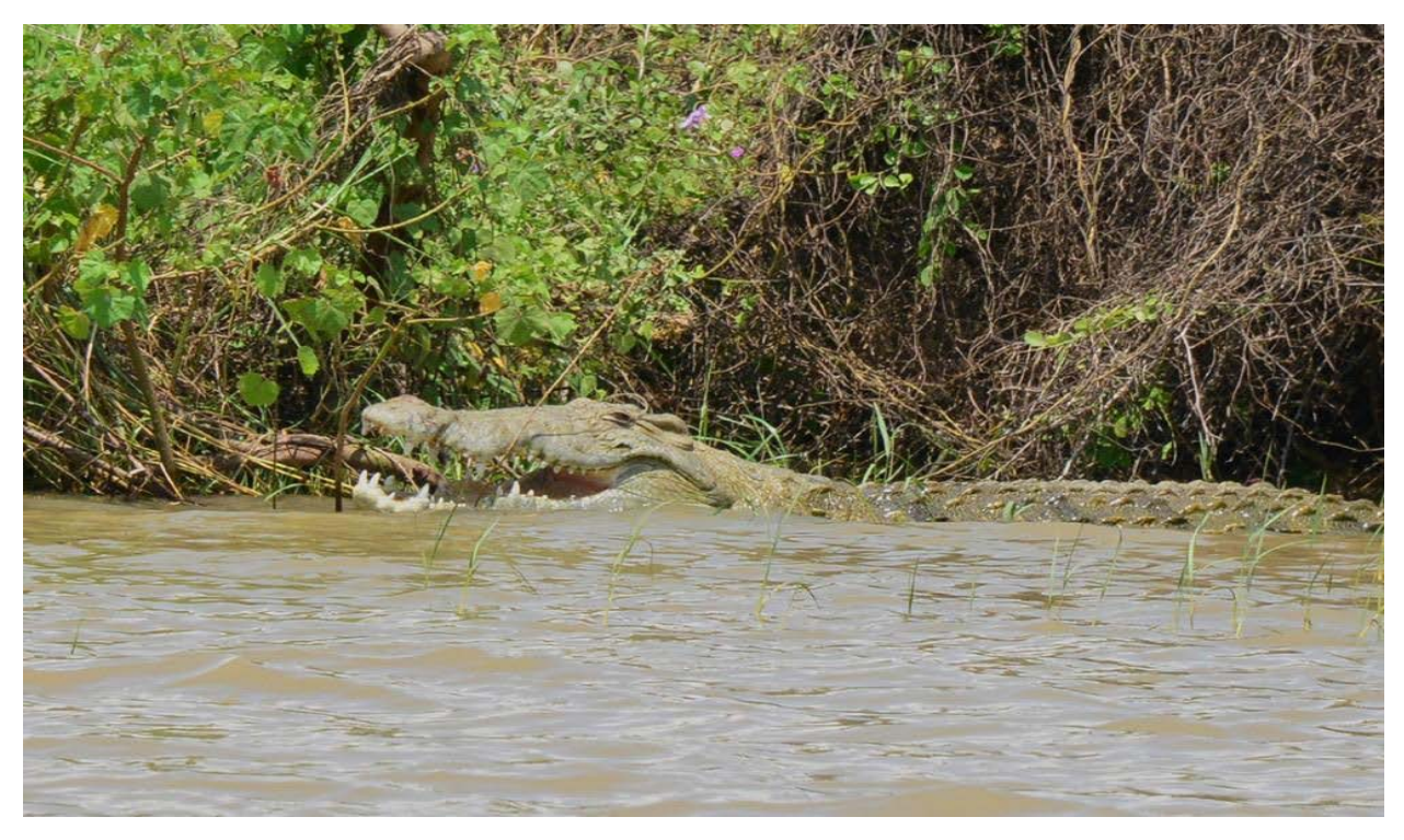
Crocodile at Lake chamo, Arbaminch

In the Morning after breakfast, drive for 70km to north towards Arba Minch and drive through Nechisar National Park then will embark on a private boat trip on Lake Chamo for about an hour to explore the wildlife, to see big African Crocodiles, families of hippos, and a number of lowland water birds.