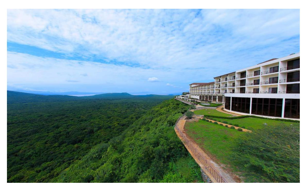
Breathtaking view from Haile Resort

Overnight: Haile Resort, Arbaminch (http://www.hailehotelsandresorts.com/arbaminch-resort)