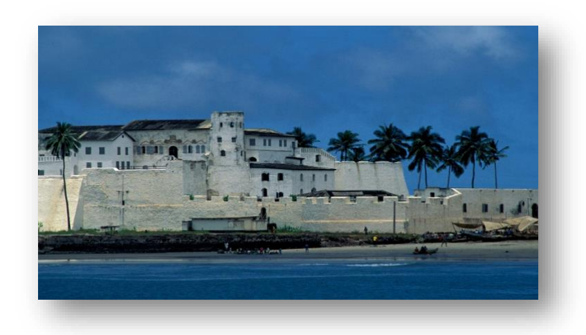
Day 6, 30<sup>th</sup> April Accra – Elmina ( 157Km, 3.30h): Slaves' Castles

Overnight: Villa Boutique 4* or similar (all rooms en-suite and with A/C, swimming pool)